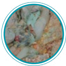
RESTAURANT & HOSPITALITY WASTE 3 to 5T/hour