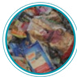
SUPERMARKET WASTE 5 to 8T/hour