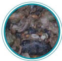
HOUSEHOLD WASTE 3 to 5T/hour