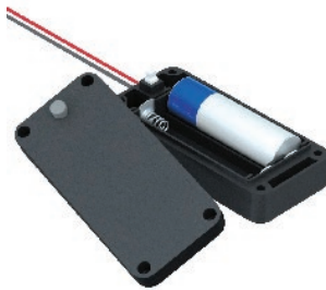
2 AA, IP65 Water Resistant Holder Part No. K2438