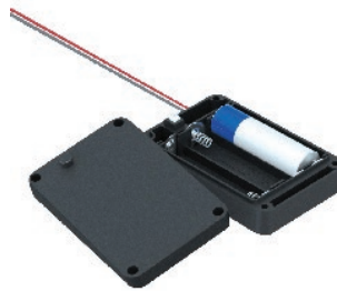
3 AA, IP65 Water Resistant Holder Part No. K2439