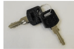
Keys x 2