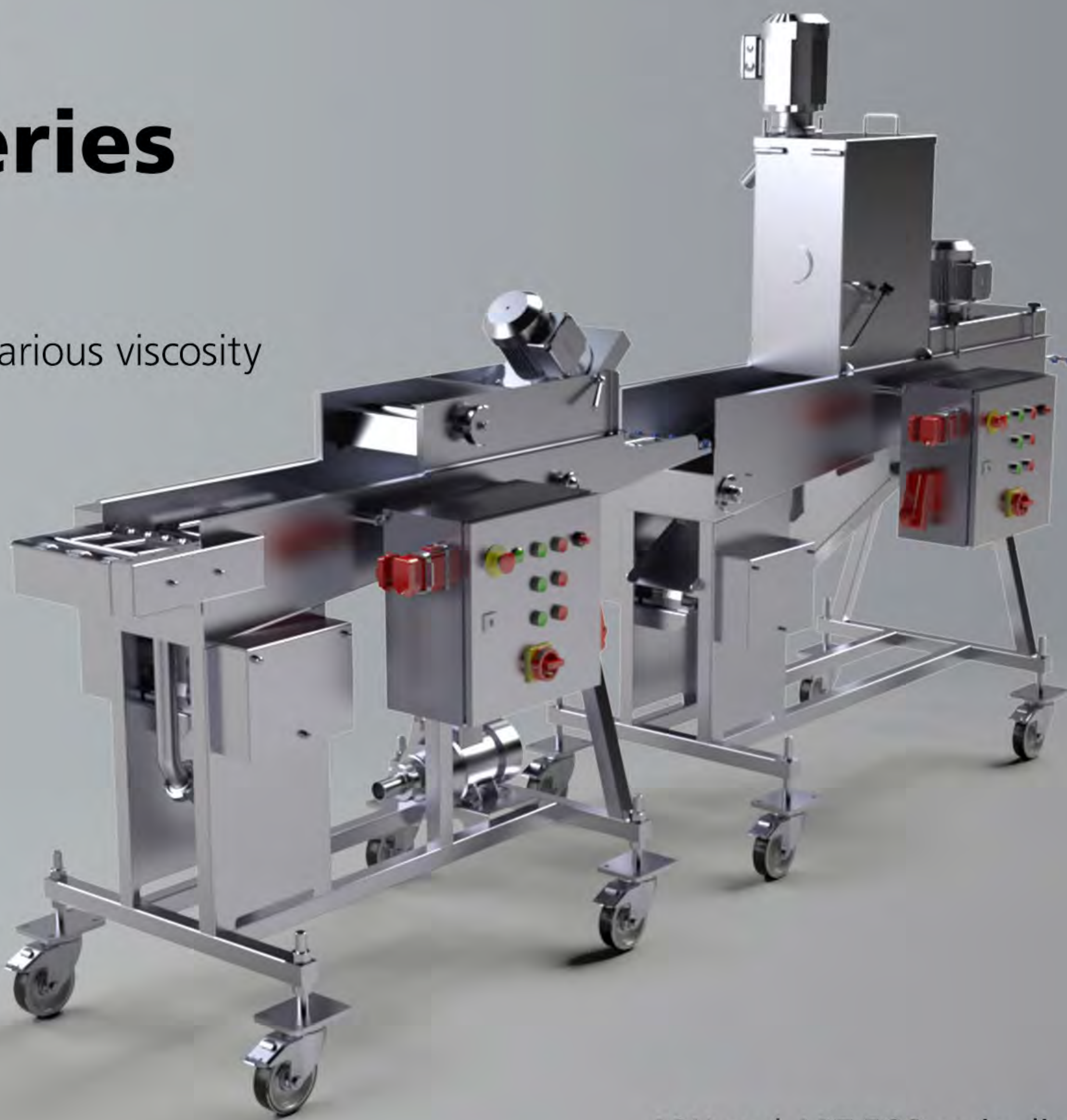
APN and APT ECO series line

In addition, breading applied with our breading machine simply speaks for itself! That's because the perfected procedure for crispy coatings handles all free-flowing breading materials, whether fine or coarse-grained.