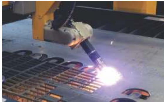
Optional bevelling head

ART ProfileShop V3 touchscreen controller gives ultimate control over every job. User log-in enables functions suitable to each operator's capabilities. Modify nests on the machine, start, stop, adjust parameters and more with a touch of the finger.