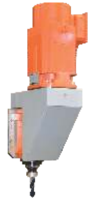
Optional drilling and tapping head

Accurate pierce height and cut height are essential for high-quality cutting and long consumable life. Automatic voltage sensing, multi-height piercing, lockout for cornering and holes, speed-proportional tracking and many more features give excellent results.