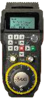
Wireless remote pendant

Pendant hand controller gives access to most functions when the operator is away from the main controller. Start, stop, recover, digitise, align plate, change tools, override feed rate and much more. New wireless pendant gives ultimate freedom with over 200 range.