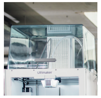
S5 Air Manager

Ultimaker S5 3D printer is required for use