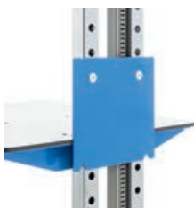
Adapter plate for lateral mounting of the battery in the fixed version.

The battery can be attached to the side of the table trolley as well as to the middle shelf. It can be easily mounted on the side of the height-adjustable table trolley. In all the other designs, the battery is mounted by means of an adapter plate (accessory) which is screwed on afterwards and into which the battery can be suspended.