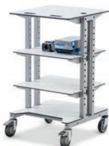
Mobile workstation with additional shelf