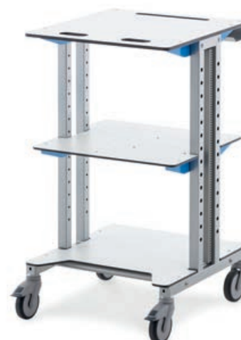
MOBILE WORKSTATION Fixed design

Hides annoying cable clutter from connected devices at the rear of the tabletop.