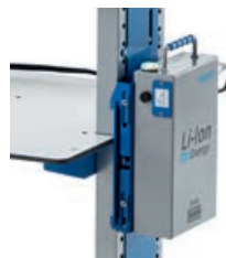
The battery can be suspended from the side plate of the height-adjustable table trolley without any additional accessories.