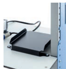
Adapter plate for mounting the battery on the middle shelf.