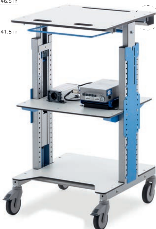
MOBILE WORKSTATION with height-adjustable table top Shown with mobile power supply (accessory)