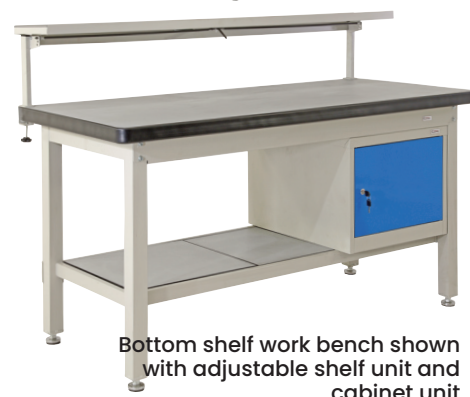
Bottom shelf work bench shown with adjustable shelf unit and cabinet unit