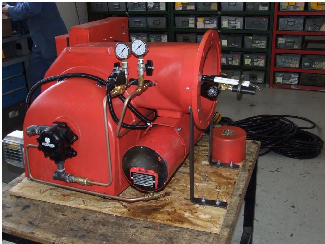
View of oil pump and recirculating oil pipework.