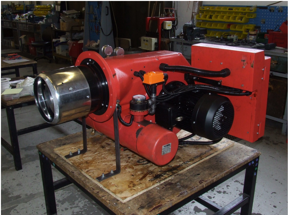
Complete burner showing oil heater tank located under the burner casing and oil temperature circulating interlock / thermostat.