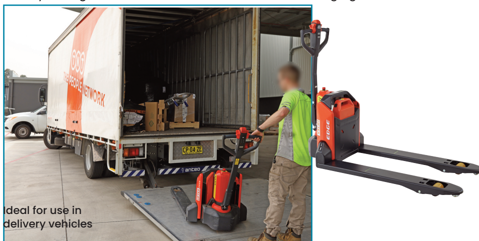
Ideal for use in delivery vehicles