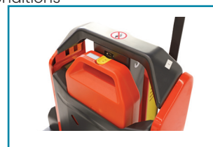
Removable Lithium Battery

Capacity up to 1500kg and ability to overcome ramps up to 4/16% (loaded/unloaded) makes the truck suitable for work in loading docks and on delivery operations in different conditions