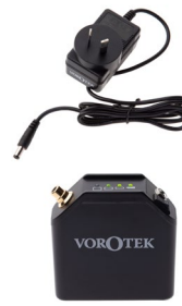
Power Pack & Charger