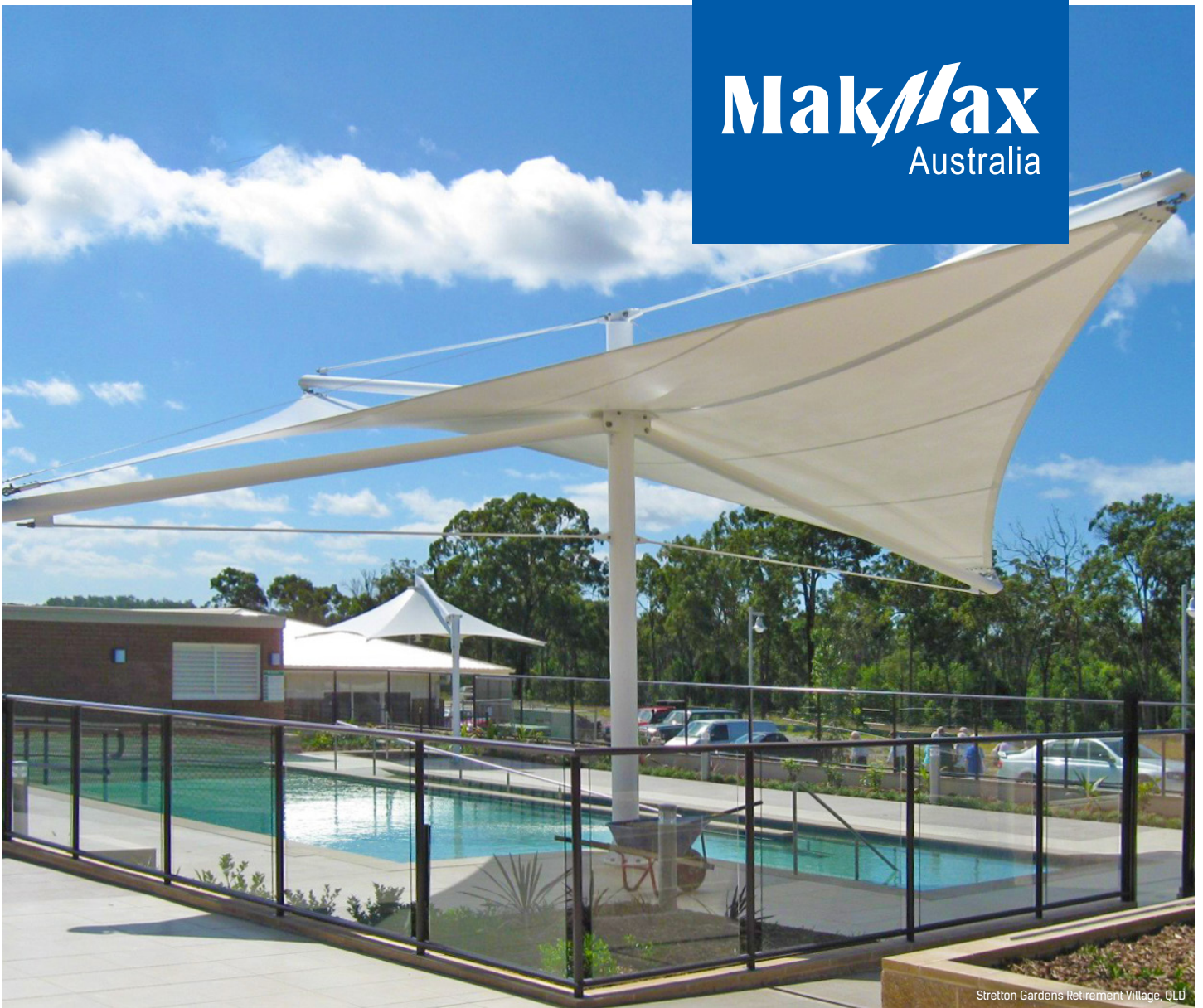
Stretton Gardens Retirement Village, QLD