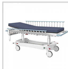
16 riser dropsides