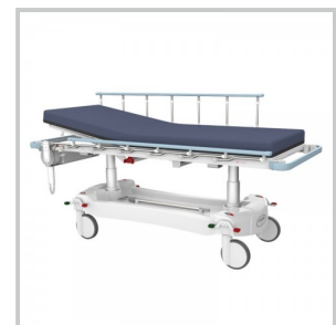
7 riser dropsides