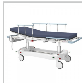
Split folding dropsides