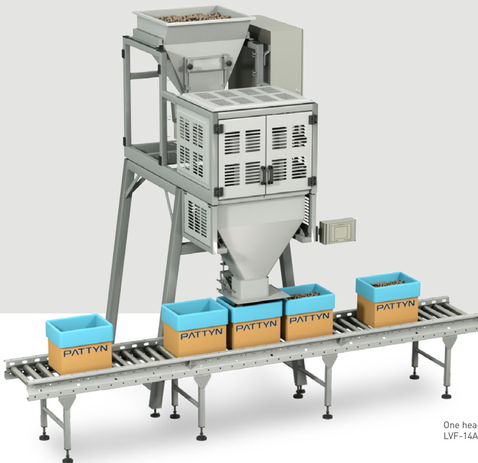
One head vibratory filler LVF-14A