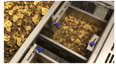
Diverter plate for coarse and fine filling