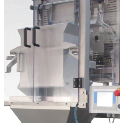
Filling in weigh hopper