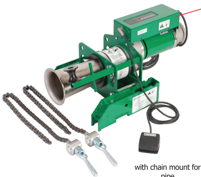
Model No. 00813 44.5 kN Rated