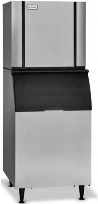
CIMO835GA ON ICB230SC