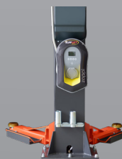
EV Charging Station