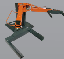
Tyre Holder Adapter