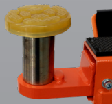
Screw Pad / 4WD Adapter