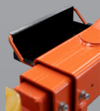
Arm Tool Tray