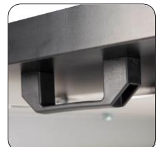
Tie-down Handles Standard – All Models