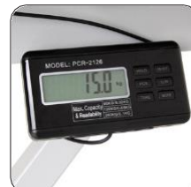
Weigh Scale – Model 50791T-WS