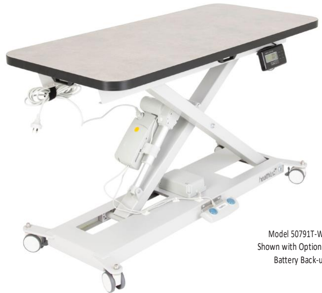
Model 50791T-WS Shown with Optional Battery Back-up