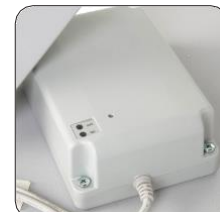
Battery Back-up Option – All Models