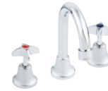
TW-SET-02 Basin Mounted Tap Set