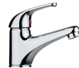
TW-MIX-01 Basin Mounted Flick Mixer