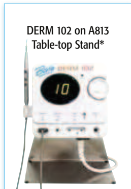
DERM 102 on A813 Table-top Stand*