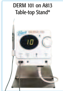
DERM 101 on A813 Table-top Stand*