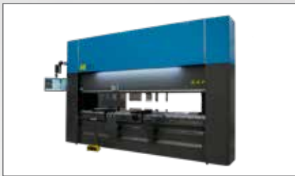
CNC Press Brakes