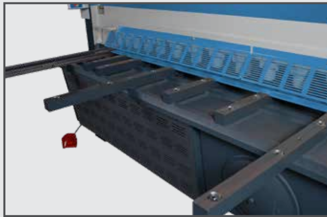
Squaring arms and front support arms with or without scale, T-slots and tilting stop. Lengths from 1000 up to 3000mm.