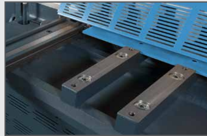
Ball transfers mounted in the iron table blocks, for easy feed-in of the sheets.