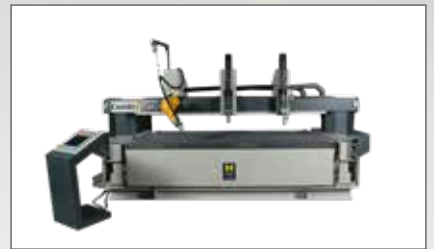
Plasma Cutting Machines

HACO NV Oekensestraat 120 8800 Roeselare Belgium T +32 (0) 51 74 64 54 E-Mail: info@haco.com www.haco.com