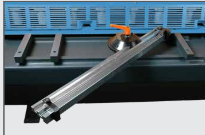
Protractor for Angle Shearing.