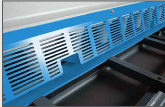
Hand safety guard with hand gaps for handling small sheets.