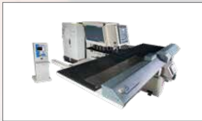
CNC Punching Machines