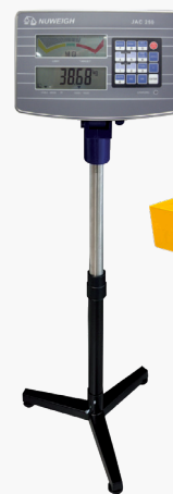
IH519 Indicator Stand