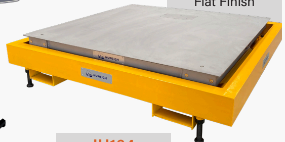
IH164 Protection Frame Checker Plate