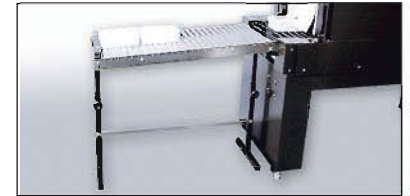
Straight Conveyor 2ft., 3ft. & 6ft.