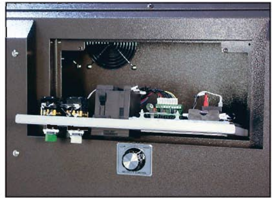
Tunnel Control Panel Lowers for Easy Access

looked at the competition. The Preferred no other Tunnel had as many standard packaging equipment we've ever owned."