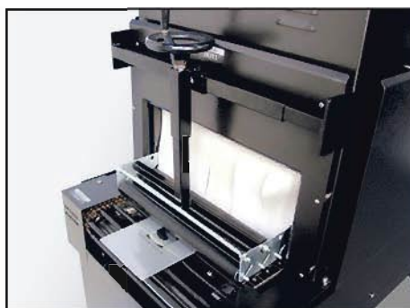
TPF System- Thin Package Fixture Keeps Package From Distorting in Tunnel