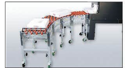
Flexible Skatewheel 16", 20" & 24" wide