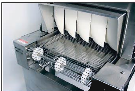
Stainless Steel Metal Mesh Belt