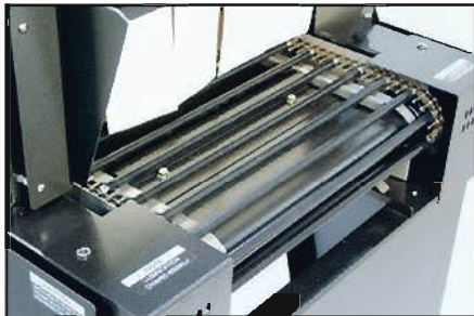
Standard Live Roller with 1" Roller Spacing