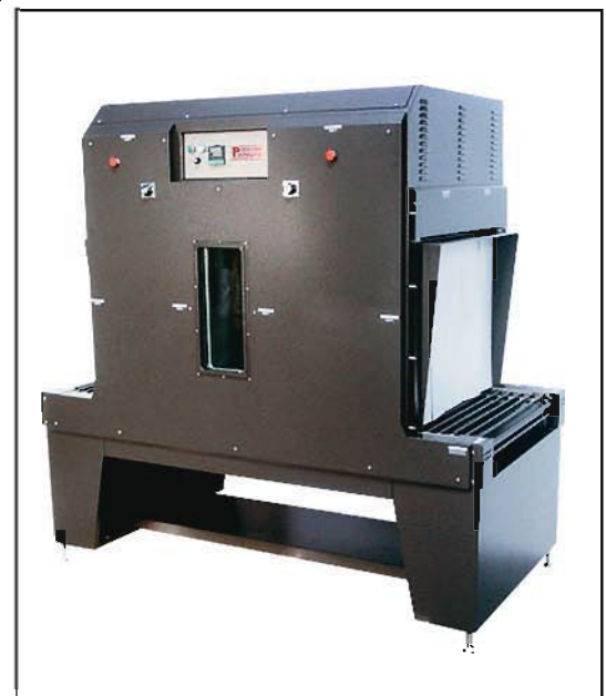
PP3628-60 Heavy Duty High Capacity Tunnel Shown with Optional Viewing Window