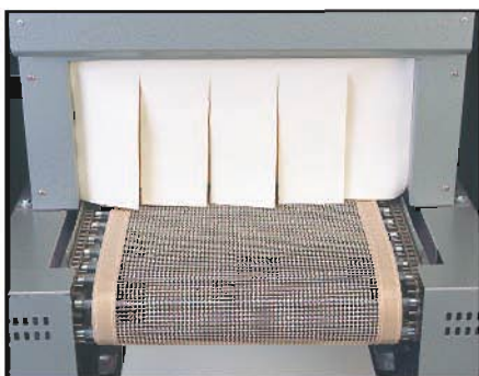
Teflon Mesh Belt Overlay

"When we were looking for a new Tunnel, we found that Preferred Pack Tunnels were definitely state-of-the-art, with many features for the price. It's the best piece of equipment we've ever owned."