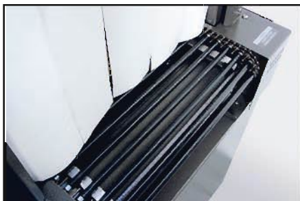
High Density Roller Conveyor Roller Spacing Only 1/2"