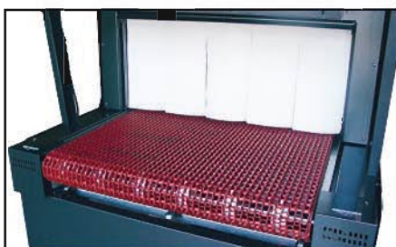
Heavy Duty Falcon Belting