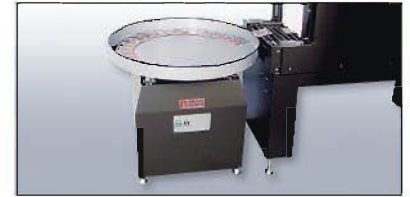
Lazy Susan Turntable 36", 48" & 60 Dia.