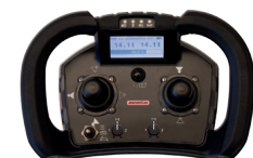
JUPITER ERA 100 CONFIGURABLE