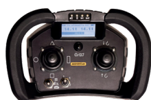
JUPITER ERA 100

The Jupiter Era waist transmitters are easy to use with a well-thought-out, robust design. The transmitters has active stop, stops in <100 ms and tilt switch, meaning they stop in the event of a fall. The waist transmitters come in three versions; Jupiter Era 100, which handles three movements at two speeds with two additional functions. Jupiter Era 150 handles three movements at two speeds with five extra functions. Jupiter Era 100 Configurable handles up to four movements at 2-4 speeds with five additional optional functions, or 11 extra functions depending on the configuration. The transmitters can be configured for different alarm events with vibration and buzzer.