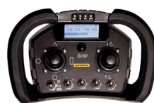
JUPITER ERA 150