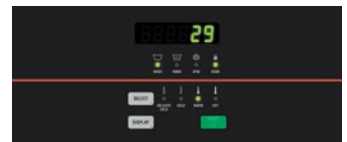
Quantum™ Standard Control