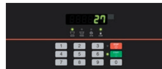
Quantum™ Gold Control