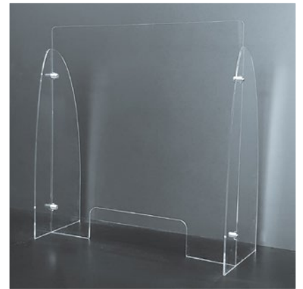
FLAT PACK SCREEN

Option: Double sided tape with tabs for taping to counter.