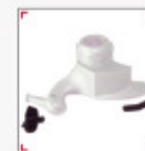
Tool Head Protection