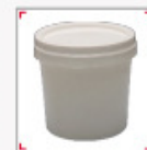
Tyre Paste Container

Swing horizontal arm with Ø41mm hexagon shaft.