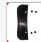
Bead Breaker Protection