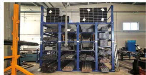
Single rack system