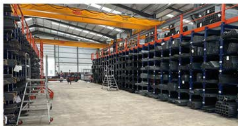
Two racks systems facing one another