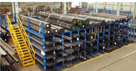
Single rack system