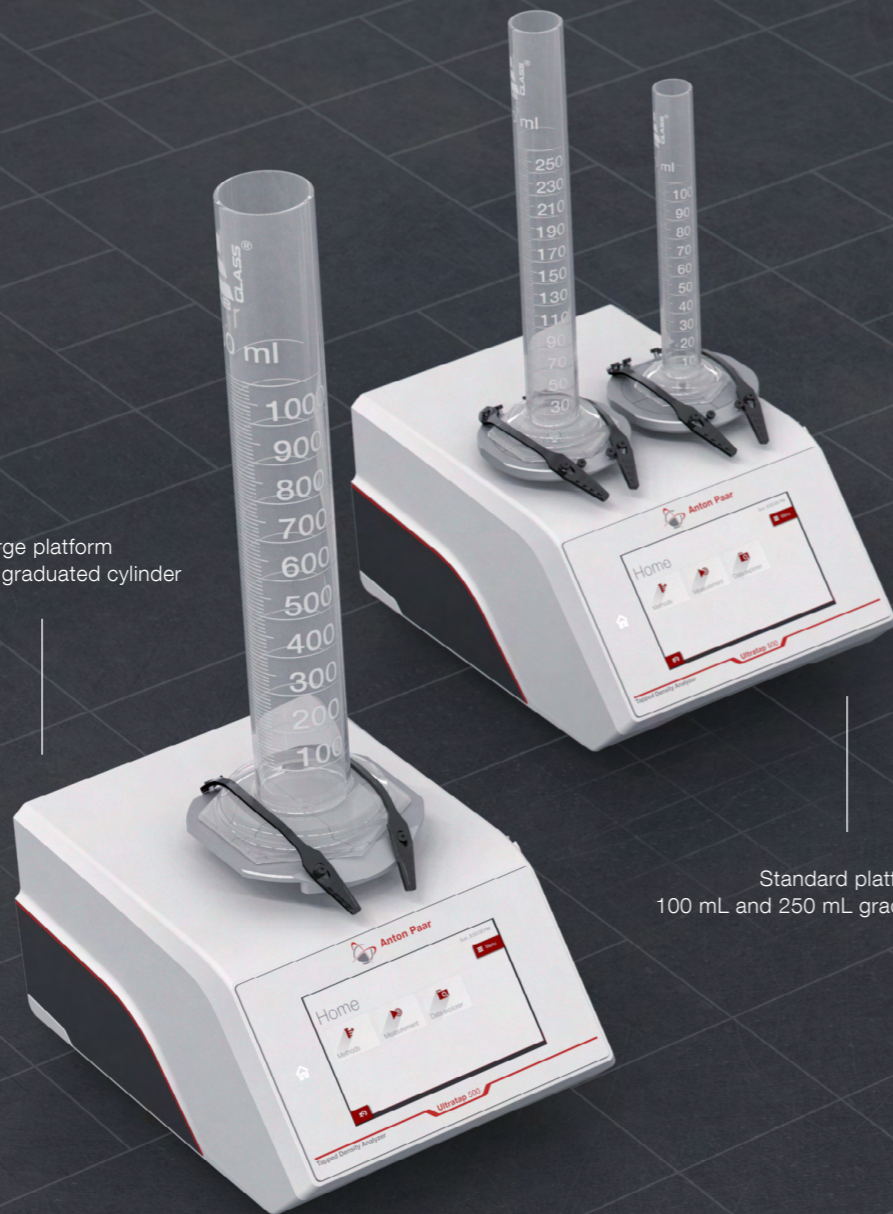
Standard platform 100 mL and 250 mL graduated cylinder