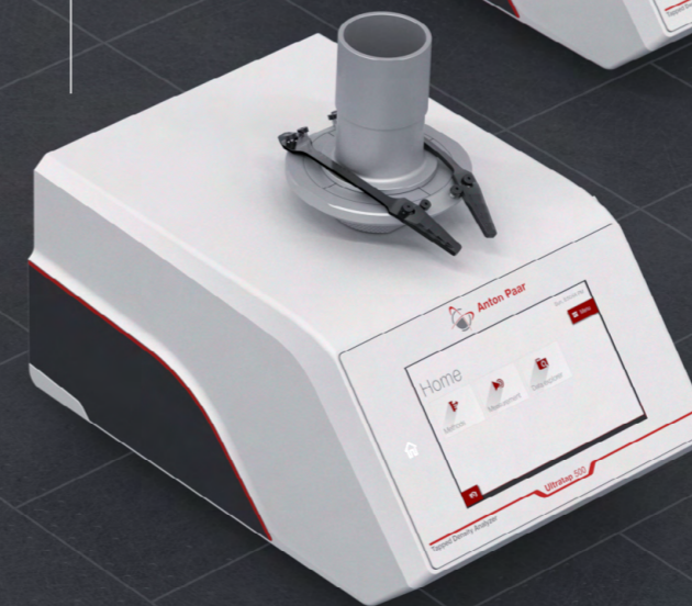
Small platform 10 mL graduated cylinder