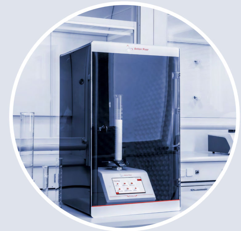
↑ NOISE REDUCTION CABINET