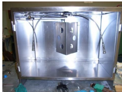
Stabilised crude oil sample collection enclosure for Swift Energy N.Z.