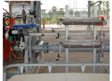
Condensate (unstabilised) sample collection skid Thailand