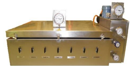
Heated sample cylinder enclosure. 6 cylinders IEC Ex Certified components