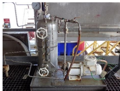
Stabilised crude oil collection skid - PNG