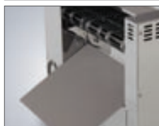
Easily removable crumb tray & reflector