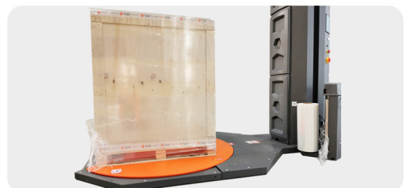
Cutting Film Process