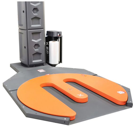
E Type Turntable