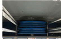
Heavy Duty Cable Pulleys