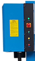
Fully Enclosed Power Unit