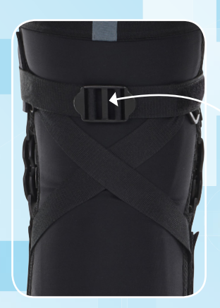
Amount of hyperextension resistance is easily adjusted with one hand