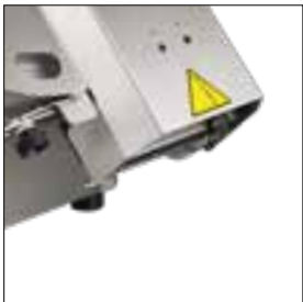
Stainless steel shutter Finger protection system fixed at the outlet of the cutting area.