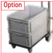
Two bread recovery trays