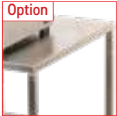
Stainless steel base