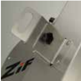
Adjustable cutting tunnel The adjustable height and width allow several types of loaves to be held, while ensuring a clean, precise cut.