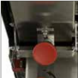
Blade adjustment handle To set the height and depth of the cut in the bread.