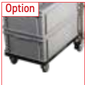
Wheeled tray support