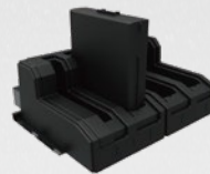
4-bay Battery Charger