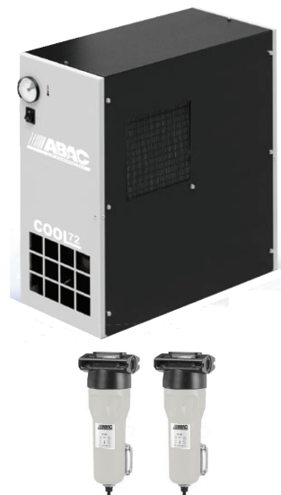
Optional Air Dryer and Inline Filtration