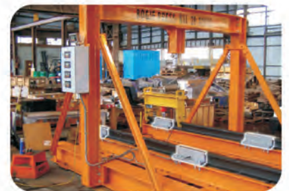
Bogie balancing press fitted with Trakmate loadcells