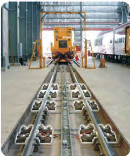
Trakmate 2 loadcells under rails