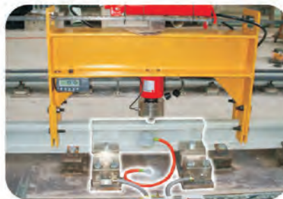
Trakmate test press is used for on-site calibration - no test train required