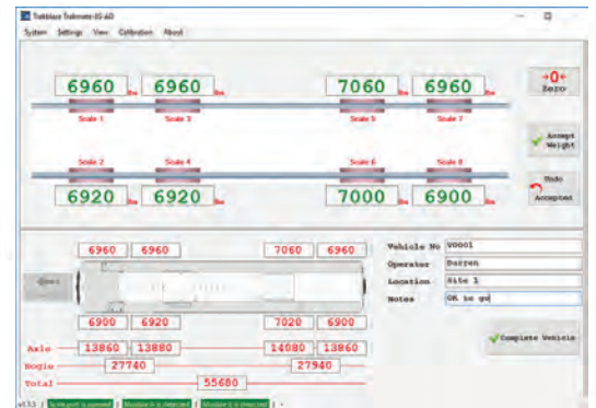
Touchscreen PC controller