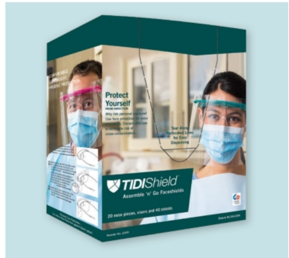
TIDISHield® Assemble 'n Go™ Face Shields PROTECTION and COMFORT