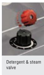
Detergent & steam valve