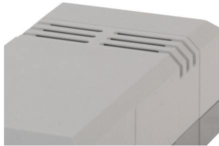
L – with integrated ventilation in the lid and base.