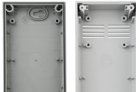
Prepared contour on the inside for wall mounting (can be penetrated with a standard tool).