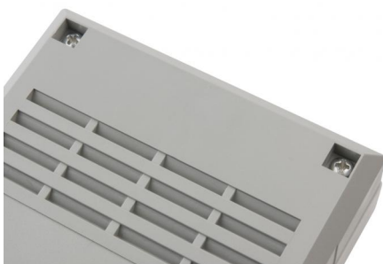
[EMPTY DESCRIPTION - FILL IT IN IMAGE REFERENCE OF CURRENT LANGUAGE (REF-ID: 3798050)]