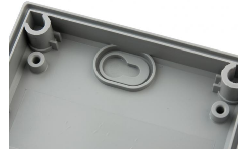
Screwing from below conceals screws in the application.