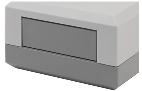
FK – plastic front panel.