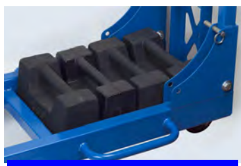
Counterweight 4 x 22,5 kg