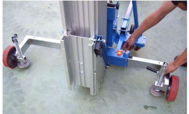
Variable wheelbase chassis with 2 lifting screw and spirit level for use on sloping ground