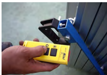
Radio remote control with emergency stop