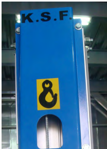
cable under steel crank-case and crane lifting point for safe transportation