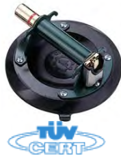
Pump vacuum suction cup Ø 200 mm Capacity 100 kg vertical body brass and steel GS Safety factor 2