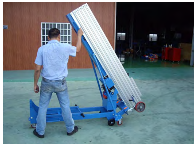
Easy tip of the mast for easy horizontal or vertical transport