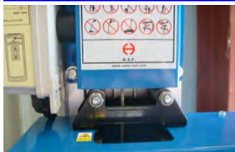
Roller fairlead for the steel cable