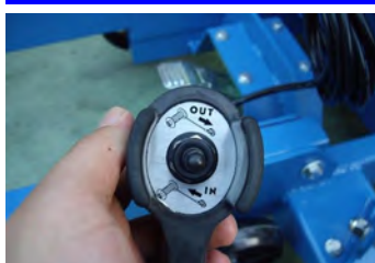
Remote control with 5 m cable