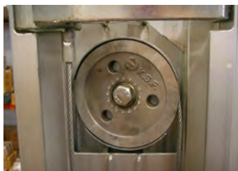
Steel pulleys with upper ring