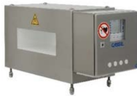
METAL SHARK® BD Ferrous in Foil detects magnetic metals in aluminum foil or trays