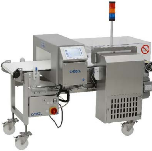
METAL SHARK BD with HQ conveyor