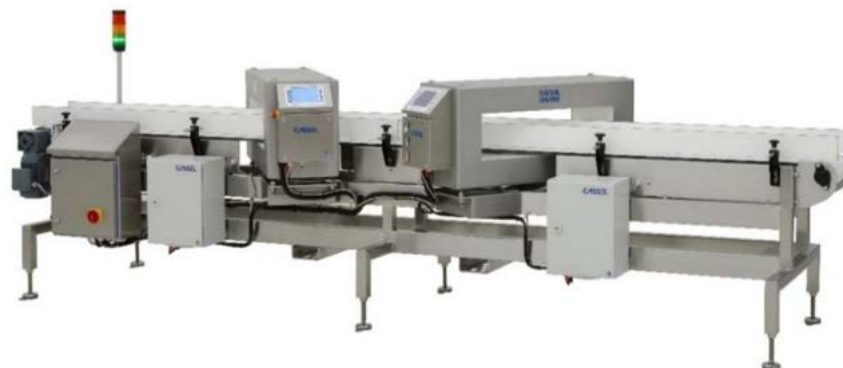
METAL SHARK® BD, Twinhead model with HQ conveyor