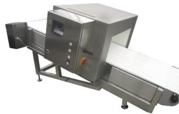
METAL SHARK® BD UltraSens provides a powerful boost to sensitivity