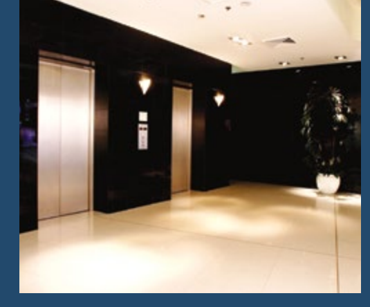
LIFTS FOR RESIDENTIAL APPLICATIONS