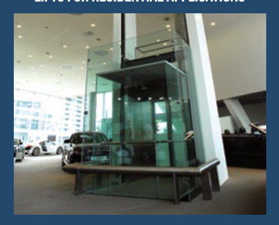
LIFTS FOR RETAIL APPLICATION