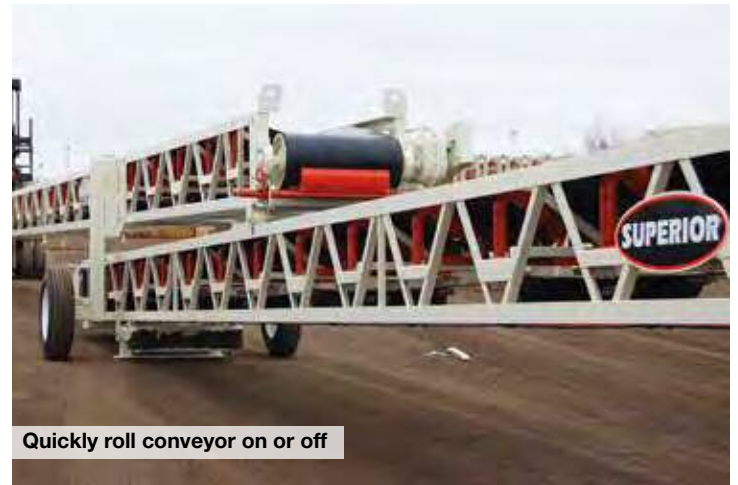
Quickly roll conveyor on or off