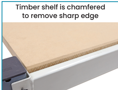
Timber shelf is chamfered to remove sharp edge