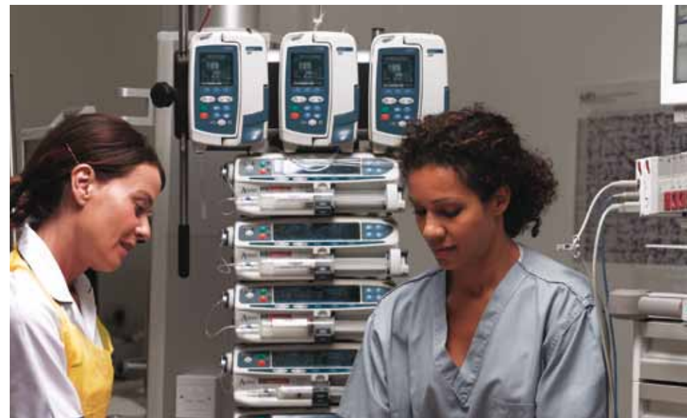
At the bedside