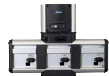
235 and 035 base unit with built-in server