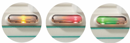
Dual independent sound-light alarm system