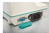
Multi function interface, AC/DC input, wire/wireless data connection, nurse call