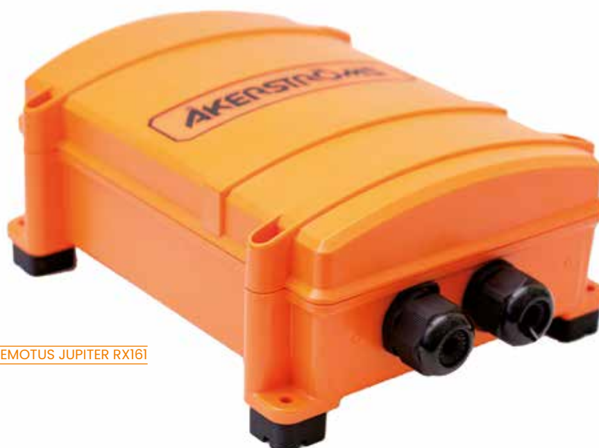
REMOTUS JUPITER RX161