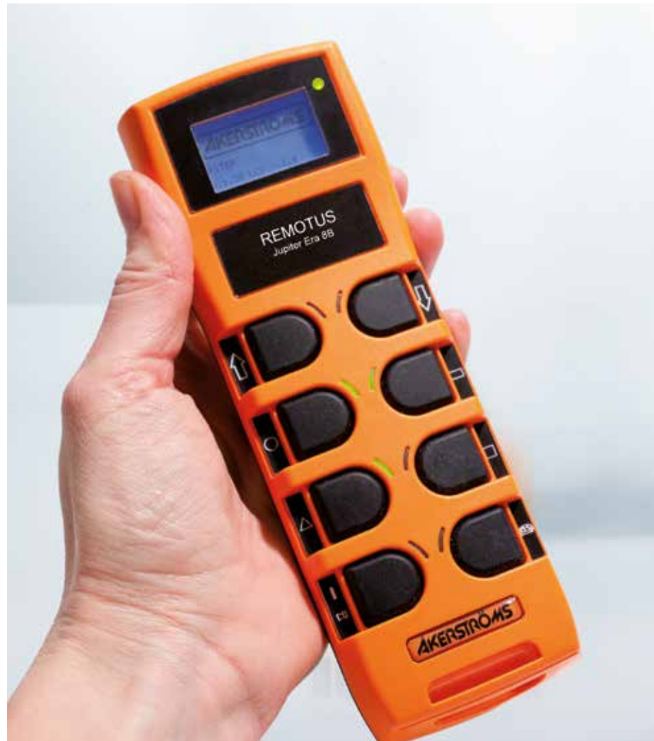
REMOTUS ERA JUPITER 8B