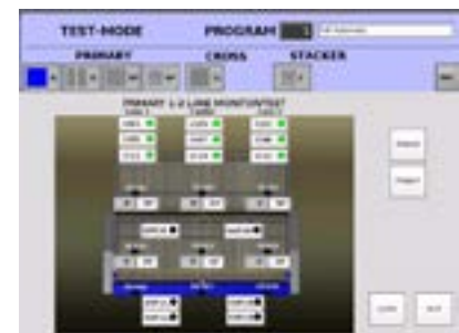
Test Mode Screen

All the traditional CHI features and functions such as automatic or manual item selection operation, piece counts, self-testing, fault display and built-in diagnostics are incorporated into an even faster PC-based color 12" display touch screen control. Its advanced architecture merges CHI's familiar simple intuitive control sequences with the technology to meet today's and tomorrow's needs.